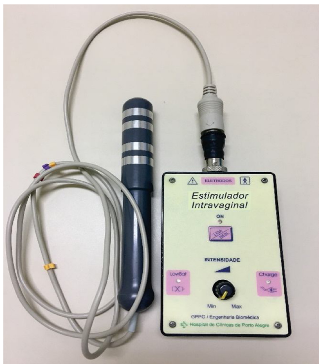
Fig. 2. Intravaginal electrostimulation device.

were expressed as mean and standard error of the mean (SEM) or median and 95%CI as appropriate. Categorical variables were described as absolute and relative (%) frequencies. To compare means between groups, Student's t -test for independent samples was applied. In case of data asymmetry, the Mann-Whitney U test was used instead. The chi-square test with standardized residuals was used to determine associations between two nominal