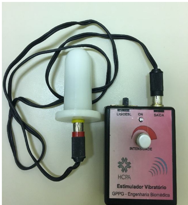
Fig. 1. Intravaginal vibratory stimulus device.