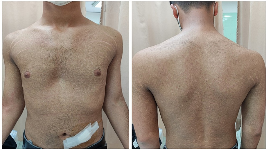
FIGURE 1: Diffused mottled hyper/hypopigmented macules over the trunk.