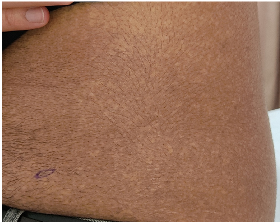
FIGURE 2: Close-up view of the patient.

There was no significant past medical history including photophobia, seizure, diabetes, or any topical or systemic drug usage. He was born of nonconsanguineous parents, and none of his family members was affected, suggesting a sporadic inheritance.