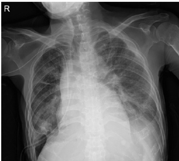
Figure 2. Catheter tip located between the superior vena cava and midportion of the right atrium.

guidewire passage failure, and 3) malposition of the catheter tip to another site. Major malposition refers to a catheter tip located in the internal jugular (Fig. 3A) or subclavian vein (Fig. 3B). Minor malposition refers to a catheter tip 1 to 2 cm above the SVC (Fig. 3C) or deep portion of the RA (Fig. 3D).