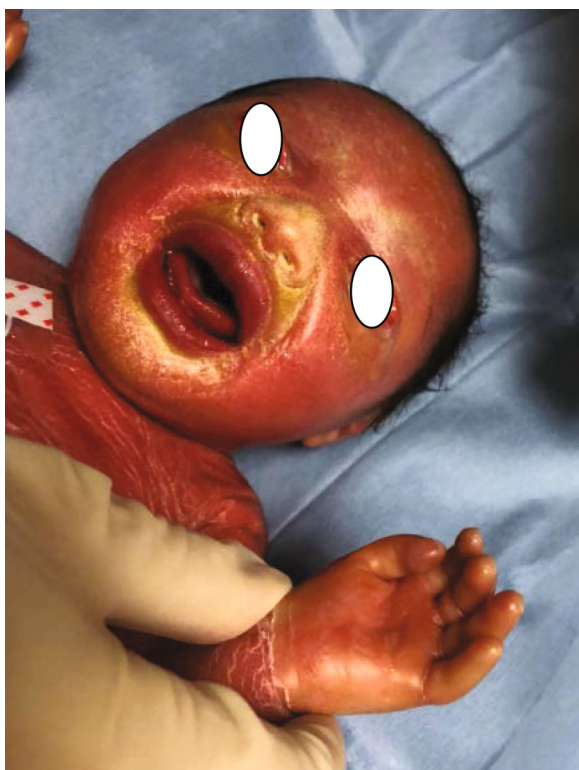
FIGURE 3: Collodion baby at birth: ectropion, collodion membrane on the hand.