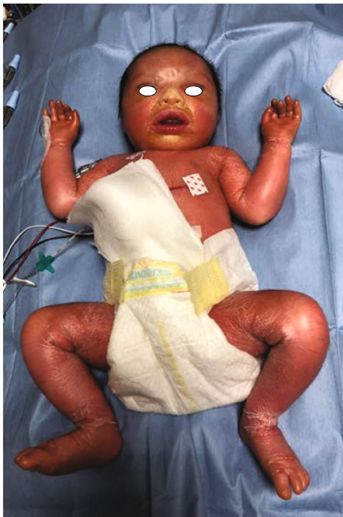
FIGURE 1: Collodion baby at birth.

families with at least one affected member. A diagnosis can be made from the twentieth week of amenorrhea by fibroscopy and feel skin biopsy. However, there is also an earlier diagnostic method that can be performed from the 10 th or 12 th week of pregnancy. This test is performed on material from chorionic villi by molecular diagnosis (PCR genomic). Many genetic mutations can be found in the baby collodion including TGM1, ALOXE3, ALOX12B, CYP4F22, PNPLA1, ABCA12, and NIPAL4. It is important to explore to determine the underlying form of ichthyosis, to provide prognostic elements, to allow genetic counselling, and to consider prenatal diagnosis in case of future pregnancy.