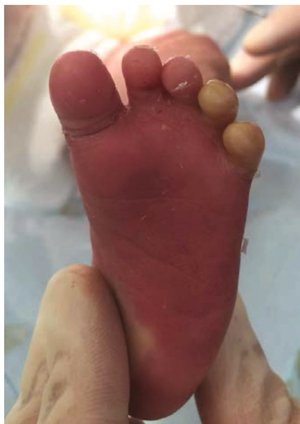
FIGURE 6: The foot during the surgery. See the difference before membrane resection (the last two toes) and after (the first three toes).

constrictive bands can lead to self-amputation. Etiologies are diverse, and the baby collodion is one of the causes. Little is known about the physiopathology. Like in all the ichthyosiform diseases, the collodion membrane is caused by a problem in the formation, maintenance, and function of the stratum corneum of the skin. It is an epidermal cornification disorder.