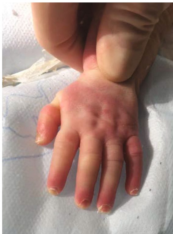
FIGURE 5: Hand after surgery.

After the 4-month follow-up, the child was fine. She presented only remnant thin membranes at the back, the scalp, the axillary hollows, and the inguinal folds. The rest of the skin looked healthy. This case corresponds therefore to a “bathing suit ichthyosis.” Genetic analyses revealed 2 mutations in the TGM1 gene. As mentioned earlier, this gene is involved in autosomal recessive congenital ichthyosis, especially in the “bathing suit ichthyosis form.”