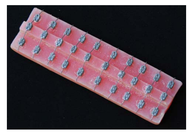
Figure 1. An acrylic model for holding wire specimens in deflected state over a 2-month period.