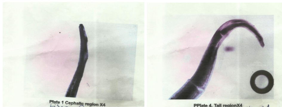
Fig 2. Male adult L. loa . The worm specimen was fixed in carnoy, stained with Giemsa and haematoxylin, and examined under a microscope, revealing the presence of a funnel-shaped mouth in the anterior region and the ventral curvature of the tail region.