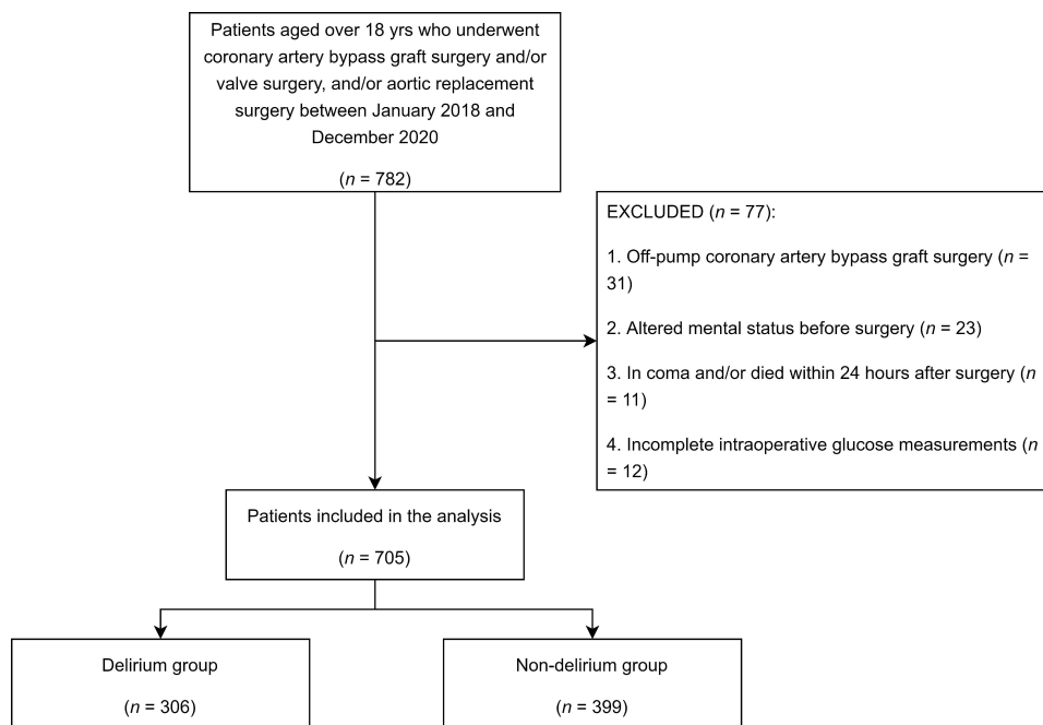
Figure 1 Flow diagram of patients included in the study.

Intergroup comparisons of preoperative and intraoperative glycemic variables are shown in Table 4. The preoperative HbA1c and glucose values at admission did not differ between the two groups. The delirium group had higher intraoperative mean glucose and peak glucose than the non-delirium group (142 [126, 163] vs 130 [119, 146], p < 0.001 , and 186 [155, 219] vs 158 [141, 189], p < 0.001 , respectively). Patients with intraoperative hyperglycemic episodes were more likely to develop POD (38.24% vs 18.55%, p < 0.001 ). When intraoperative glycemic CV was compared as a continuous variable, the delirium group had higher intraoperative glycemic CV than the non-delirium group (22.59 [17.09, 29.68] vs 18.19 [13.00, 23.35], p < 0.001 ), and when intraoperative glycemic CV was classified as quartiles, the incidence of POD increased as intraoperative glycemic CV quartiles increased (first quartile 29.89%; second quartile 36.67%; third quartile 44.63%; and fourth quartile 62.64%, p < 0.001 ).