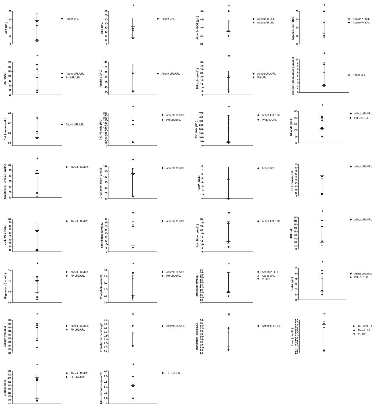
Fig. 1. Reference Ranges (RR) for Chemistry tests. For each test, the LRL and URL (—), Confidence Intervals (–) and intervening range (|) are shown. Respective LRLs and URLs quoted by Abbott and Pathology Harmonisation (PH), where available, are also shown for comparison. *Indicates tests where Abbott and/or PH RRs are outside our RR’s CIs.

chemistry tests, method specific RRs are justified e.g. LDH, where there is a range of commercially available assays and sub-types e.g. Lactate to Pyruvate and vice versa giving very different results (two-fold).