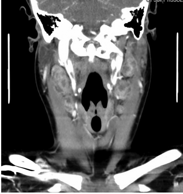
Figure 2. Coronal view of a contrast-enhanced computed tomography demonstrating bilateral enhancing masses with loculations and necrosis.

been reported more frequently in Europe and Asia, and it is most commonly seen during the summer months in children younger than 14 years.<sup>2</sup>