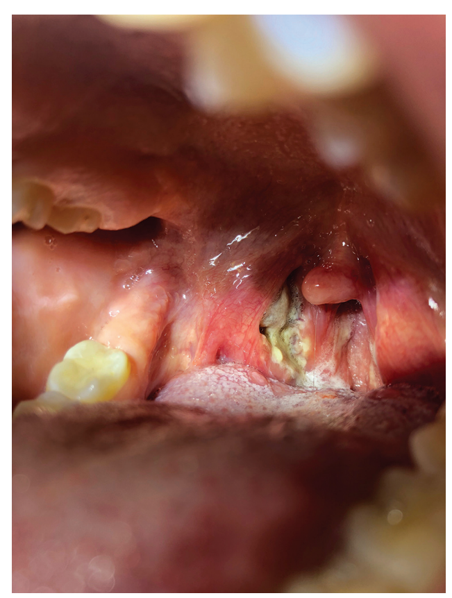
Figure 1. Clinical photograph showing a necrotic lesion on the right palatine tonsil.