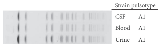
FIGURE 2: Dendrogram generated by BioNumerics showing the results of cluster analysis on the basis of XbaI PFGE of E. coli isolates from blood, urine, and CSF.

Literature data suggest that community-acquired meningitis in adults due to E. coli usually develops secondary to metastatic infection in patients with bacteraemia of intestinal origin [6, 7]. In a recent retrospective series of spontaneous Gram-negative meningitis, E. coli was the most common pathogen, and the mortality rate was still 53% [8]. Specifically, multivariate analysis identified urinary tract as focus of infection as the most important independent factor associated with a higher risk of spontaneous Gram-negative bacilli meningitis [8]. This finding is clinically relevant, since a Gram-negative bacillary etiology should be suspected in adults with spontaneous acute meningitis who have a history or a simultaneous diagnosis of bacteraemic urinary tract infection. Our patient had an asymptomatic bacteriuria with an E. coli isolate of community origin. The only risk factor for disseminated infection was the presence of a bladder catheter at the time the patient was hospitalized in the ICU.