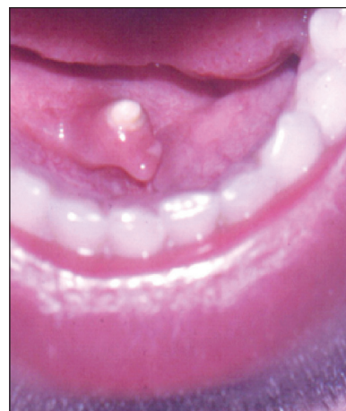
Figure 2: Huge right submandibular sialolith, exposed in the orifice of Wharton duct.