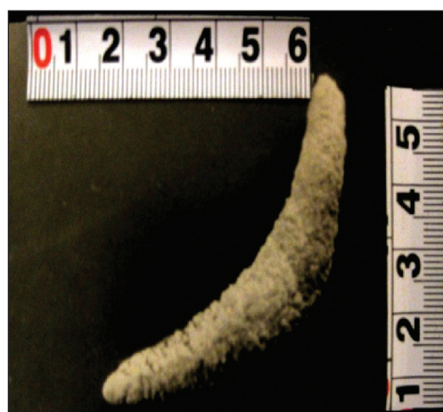
Figure 4: Giant submandibular sialolith.