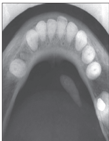
Figure 3: Transocclusal endoral radiography showed a radiopaque stone within the right Wharton duct.

In many cases, the diagnosis is easy due to obvious clinical features. Careful history and examination are important in the diagnosis of sialolithiasis. Sialoliths can occasionally be palpated. Pain and swelling of the affected gland at mealtimes are especially important. However, imaging studies are very often necessary for treatment. [3-5] Submandibular gland sialoliths have been reported to be radiopaque in 80-94.7% of cases and can be seen on plain films. [11,12] The most common radiographic techniques used to diagnose sialolithiasis are panoramic or occlusal views. Ultrasound, scintigraphy, or sialography (radiographic examination of the salivary glands and ducts after the introduction of a radiopaque material into the ducts) can be useful for arriving at a diagnosis. [13-19]