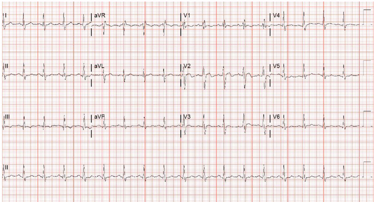
FIGURE 2: EKG 10 hours following cessation of propofol administration showing reversal of Brugada pattern.

distension with anuria and was taken back to the OR where a decompressive exploratory laparotomy with evacuation of an intra-abdominal hematoma was performed. On POD 12, an EKG was obtained and demonstrated type I Brugada pattern (Figure 1). After identification of type I Brugada pattern, propofol was discontinued, and EKG