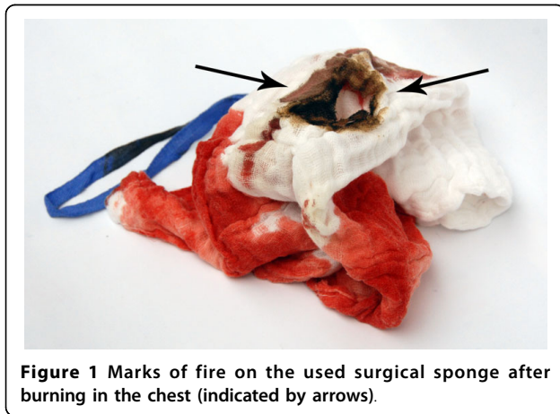
Figure 1 Marks of fire on the used surgical sponge after burning in the chest (indicated by arrows).

VC: vital capacity; FEV1: forced expired volume in 1 second; RV: residual volume