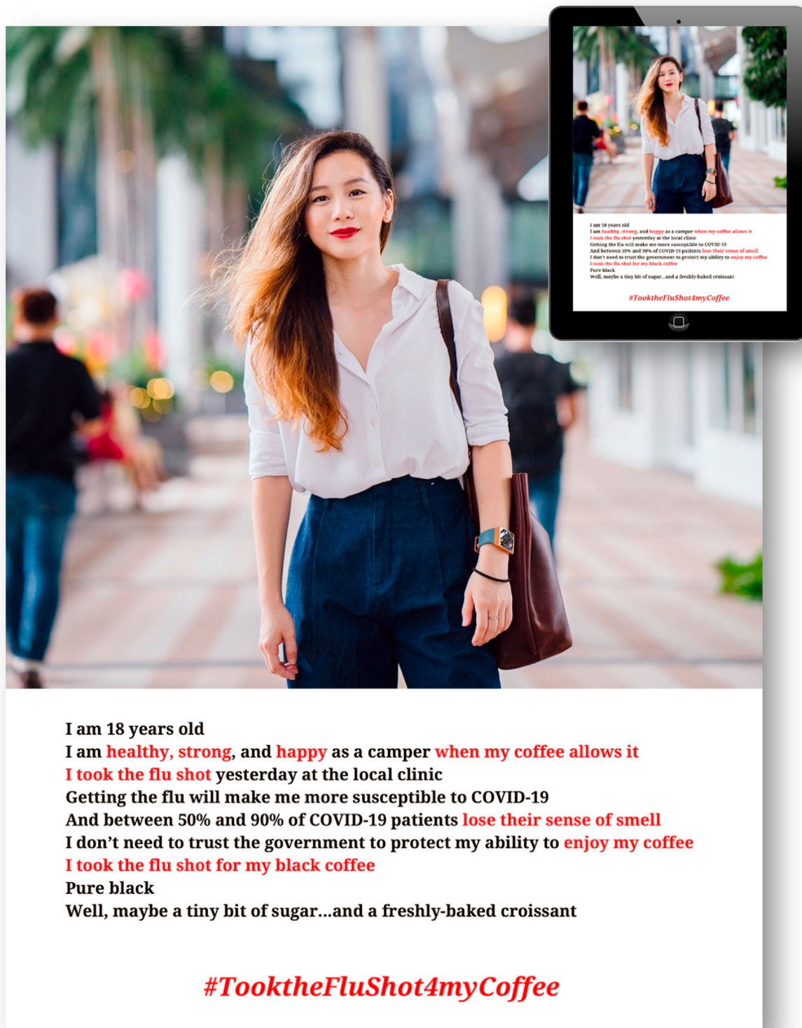
Fig. 3. An example seasonal influenza vaccination campaign (moderate-level fear appeal).