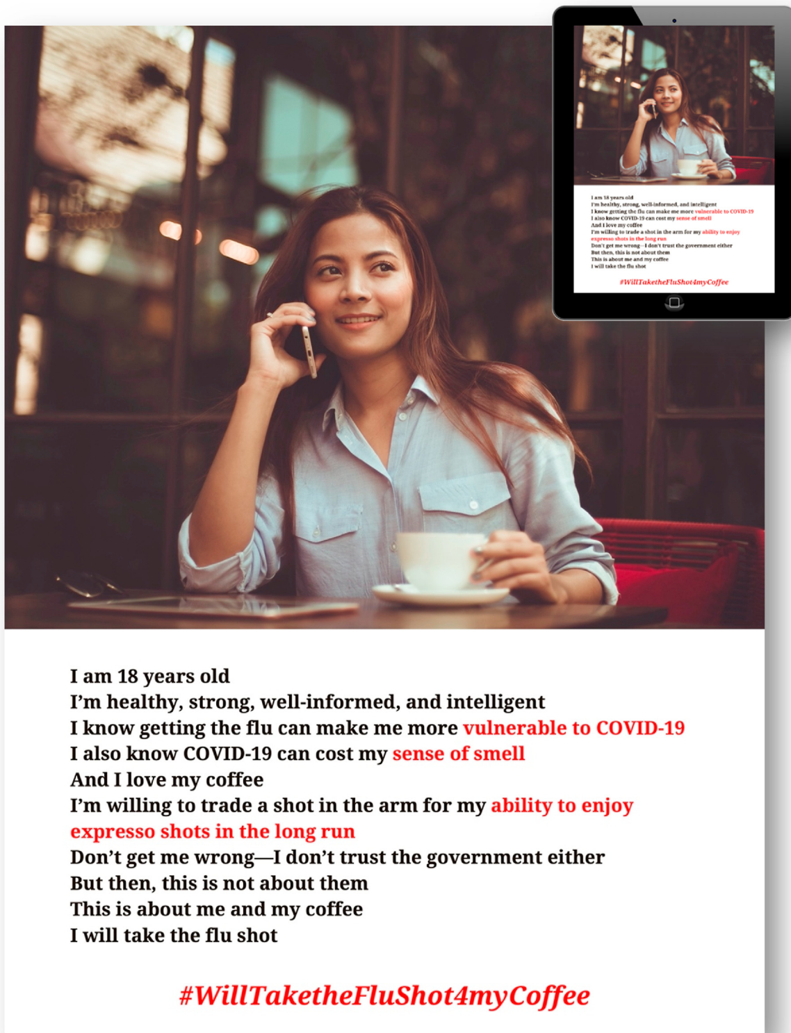
Fig. 2. An example seasonal influenza vaccination campaign (low-level fear appeal).

be informative, without “a lot of persuasion or other advertising tactics” (Participant 35), most participants expected some persuasive components such as appealing visual design and attention-grabbing health messages. In addition to some preferences being “attention grabbing, with a brief but powerful message” (Participant 302), respondents also suggested that they wish to be persuaded with fear appeals to be