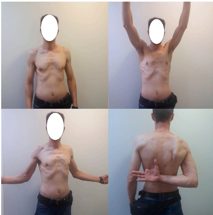
Fig. 3. Physical and functional outcomes at the end of the 18 mo follow-up period. The patient was pain-free, without restriction of range of motion, and no difference in strength compared to the contralateral arm. The constant shoulder score of the right shoulder was 100.

distal clavicular fractures with use of an arthroscopic-assisted double-endobutton. Four patients were treated with this technique, and all achieved union of the fracture and a mean constant shoulder score of 95 at 6 mo follow-up. The same author, in 2013, proposed the double-button technique for treating Latarjet fractures [14]. Arthroscopic treatment of these lesions is time consuming and a very demanding procedure but provides excellent clinical results; although, it is not superior to open surgery.