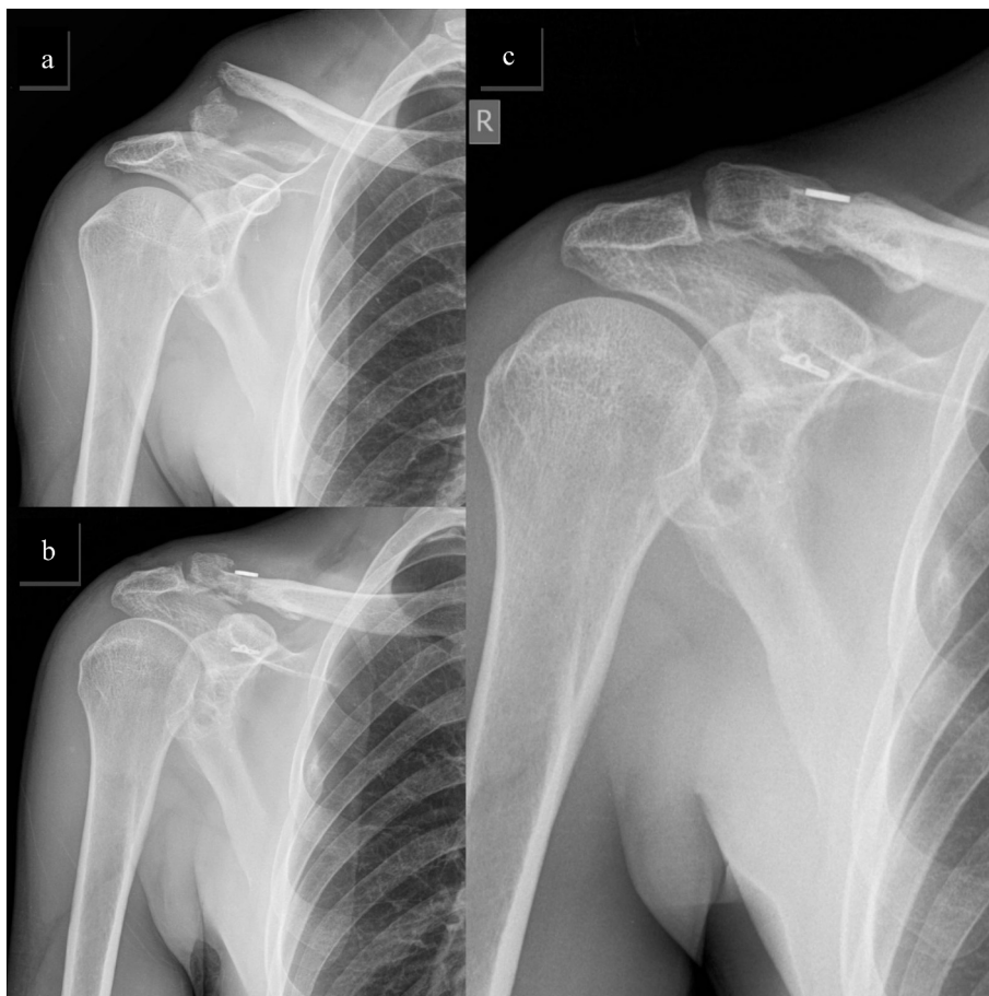
Fig. 1. Radiographic history of the fracture in this case. A: Latarjet fracture was diagnosed based upon the finding of an avulsed fracture of the coracoclavicular ligaments and upward displacement of the central fragment of the clavicle; B: Postoperative radiograph confirmed the endobutton passing through the medial fragment, avulsed inferior fragment and coracoid; C: Control radiograph at 18 mo after surgery showed osseous union of the fracture with alignment in acromioclavicular articulation.

Under direct visualization and radiographic control, the correct placement of the pin was confirmed and a 4.5 reamer was placed over the guide pin through the clavicle and coracoid. Next, the endobutton (zip tight fixation system) was passed through the holes and ensured with pulling of the nonabsorbable sutures and tightening over the round button on the clavicle. Finally, a radiograph was