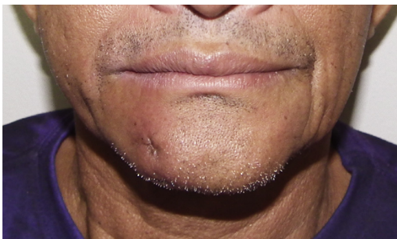
Fig. 5. Final clinical appearance after 4 weeks.

Long-term antibiotic therapy is common for treating routine cases of actinomycosis as shown in Table 1 . Most reports focus only in abscess drainage or tissue biopsy, somehow neglecting the advantages of surgical debridement on tissue healing. Usually, conservative management is linked to prolonged antibiotic therapy [7,9,12,15].