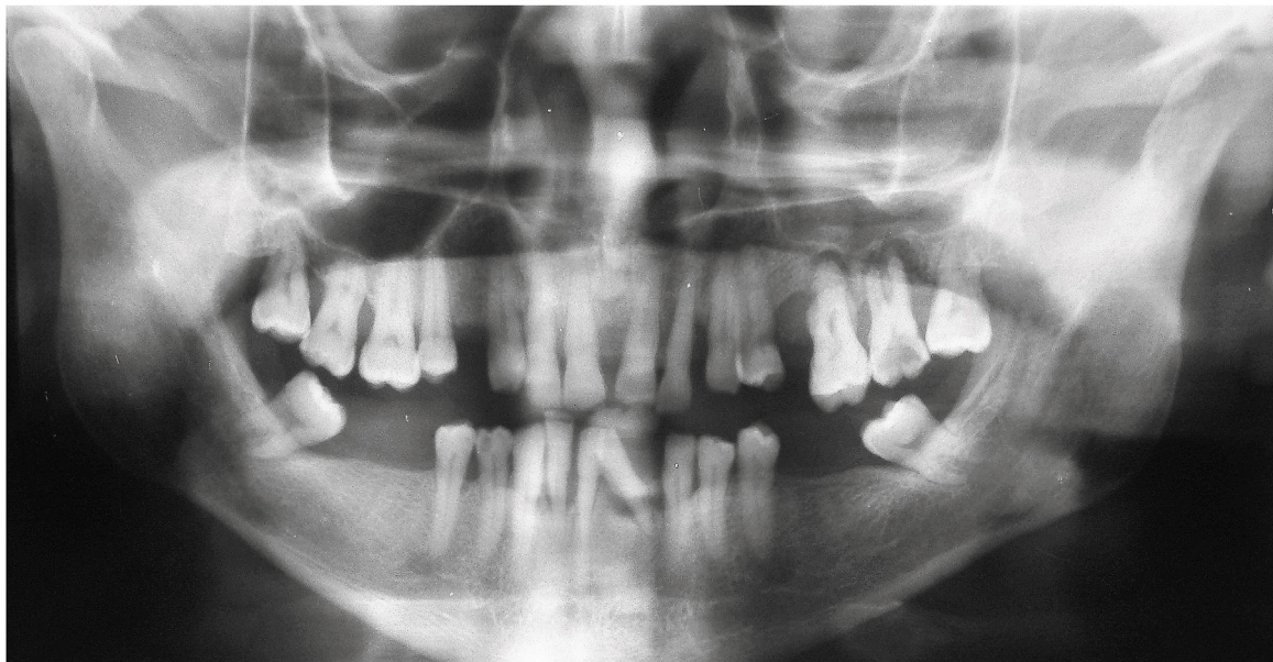
Fig. 2. Panoramic radiography: teeth with severe periodontal disease—31.41 and 42—but without the presence of bone rarefaction.