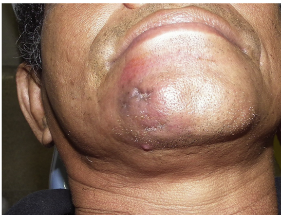
Fig. 4. Clinical aspect 12 days after surgery.