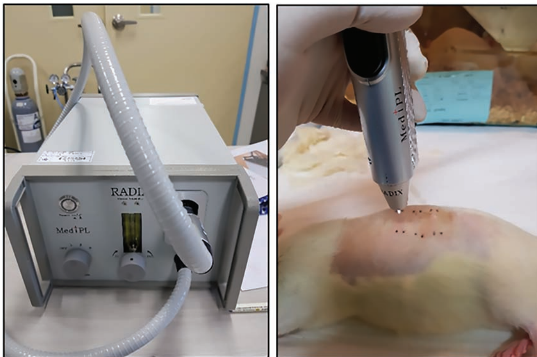
Figure 1. Nonthermal atmospheric pressure plasma jet (left) and its application on unburned interspace (right).