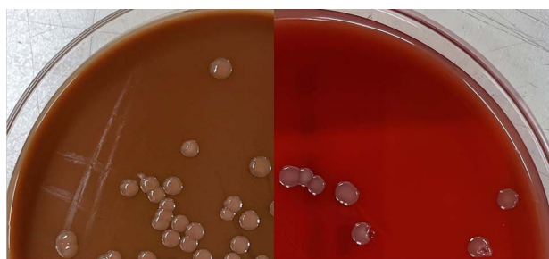
Figure 1. Shewanella algae colonies grown on chocolate (left) and blood (right) agar plates.

KOH mount smear and fungal culture. Empirical treatment with tobramycin, moxifloxacin and ofloxacin eye drops was started. The KOH smear and Gram stain were negative. After a 2-day incubation, medium-sized gray and dark pink colonies grew on blood agar plate and chocolate agar plate (Fig. 1). Other types of colony did not grow on the plate. S. algae was identified by matrix-assisted laser desorption/ionization time-of-flight mass spectrometry using the Vitek system (bioMérieux, Marcy-L'Étoile, France). 16S rRNA sequencing revealed 99.93% (1410/1411 bp) identity with S. algae JCM 21037(T) (GenBank accession number BAL001000089). Susceptibility testing of the isolate indicated susceptible to amikacin, aztreonam, cefepime, ceftazidime, colistin and gentamicin, resistant to cefotaxime, imipenem, piperacillin and piperacillin/tazobactam, and intermediate to ciprofloxacin, levofloxacin and meropenem. We added steroid eye drops to control the inflammation and continued the antibiotic eye drops. After 14 days, his keratitis had improved.