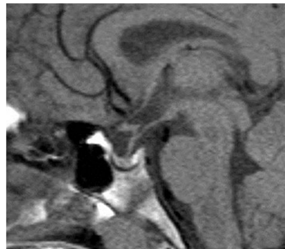
Figure 2 Magnetic resonance imaging scan of the pituitary gland of our patient.