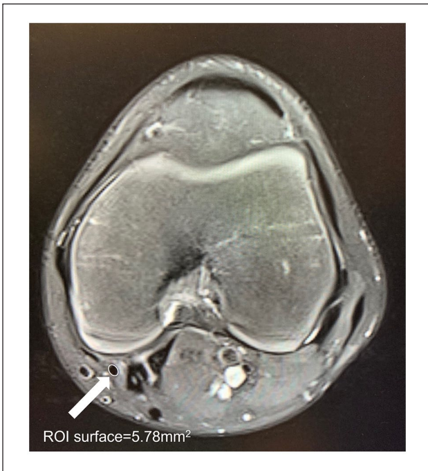
Figure 2. Left knee. Fat-saturated T2, axial MRI slice, gracilis tendon identified medially from the semitendinosus (arrow), measured by the freehand ROI tool. Window indicating the measurement in \text{mm}^2 , performed with Siemens syngo.via MRI reading software.

descriptive analyses were done to describe our sample. Cronbach's alpha was used for intra-observer reliability. Tests to determine the intra-class correlation were done to evaluate inter-observer reliability. Linear regression analysis was used to analyze the relationship between the