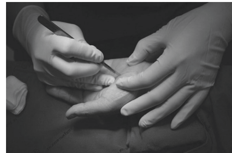
FIGURE 1: The first step for author's surgical technique.

The carpal tunnel operation in this group is female 95%, male 5% with mean age 55.4 years old. Clinical evaluation is shown in Table 2. Most clinical involvement is related to