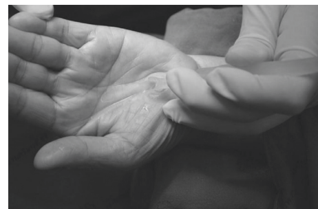
FIGURE 3: The third step for author's surgical technique.

right hand, numbness symptoms, Tinel sign positive, Phalen test positive, and Durkan compression test positive. Operative evaluation is shown in Table 3. Wound scar sizes gradually were reduced in three months. Postoperative evaluation is available for review in Table 4. A minor complication, pillar pain, was found in only one case (6.7%)