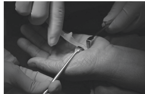
FIGURE 2: The second step for author's surgical technique.