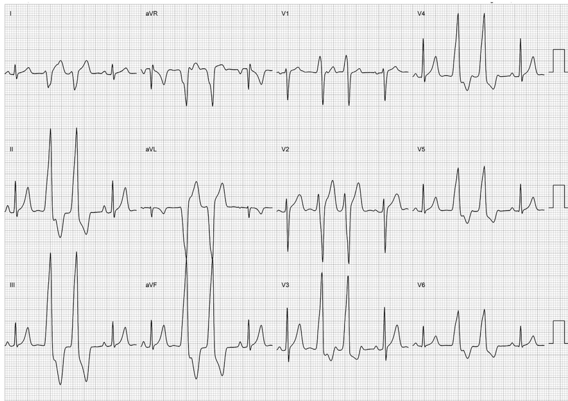
Fig. 1. Representative ECG from a patient with PVCs. Twelve-lead electrocardiogram from a patient with PVCs that were mapped to the left coronary cusp region. PVCs are seen as couplets. Frontal axis is inferior, consistent with outflow tract origin, and while the transition is at V3, a prominent R wave in V1 is suggestive of LVOT origin. ECG, Electrocardiogram; LVOT, left ventricular outflow tract; PVCs, premature ventricular complexes.

In a group of patients with VT or premature ventricular beats mapped to the left coronary cusp, we found that an approach of using low energy was associated with a high success rate without recurrences. We used power of 15 W with a duration of 30 s in most patients. Our results suggest that use of higher powers may not be necessary, thus reducing the risk of damaging important adjacent structures in this area.