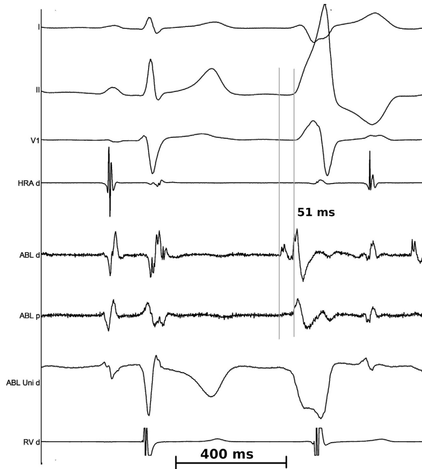
Fig. 2. Intracardiac electrograms showing the signals at the successful site in two patients. Intracardiac electrograms are shown from one patient during mapping of the PVCs. Three ECG leads are shown at the top, followed by a right atrial electrogram, bipolar electrograms from the distal and proximal bipole pairs of the mapping catheter, and a unipolar electrogram from the distal electrode. A fractionated component can be seen in the ventricular electrogram, which is late in the sinus rhythm beat and early before the PVC. ABL, ablation catheter; ECG, Electrocardiogram; PVCs, premature ventricular complexes; RV, right ventricle. HRA, High right atrium

Initial reports on ablation of VT in the aortic cusps mention the use of temperature-controlled setting, maintaining tip temperature of 55–60 °C and maximum power of 25–30 W for 60 s. 1,4,5 Yamada et al 6 used an initial power of 30 W and went up to a maximum