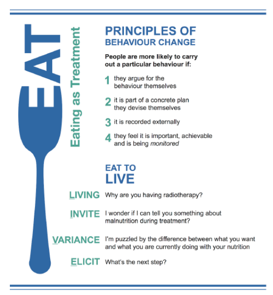
Figure 1. Eating As Treatment (EAT) Intervention: Key principles and prompts for clinicians.

The "EAT to LIVE" conversation (see Figure 1) draws upon established principles of behaviour change and requires the dietitian to (i) elicit patient motivation for undergoing radiotherapy treatment