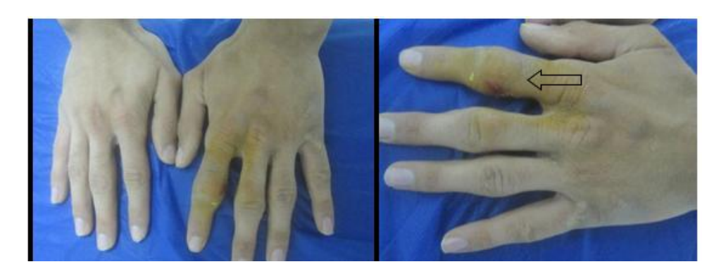
Fig. 1: Left Soft-tissue swelling on the proximal interphalangeal joint of the second through fourth fingers with thickening of the skin Right: Close view

ling without bone or articular abnormalities or space loss. His left-hand span was broader and his left fingers were longer than right ones, and had borderline joint laxity but without any remarkable signs of Ehlers Danlos. Routine laboratory screening, were normal.