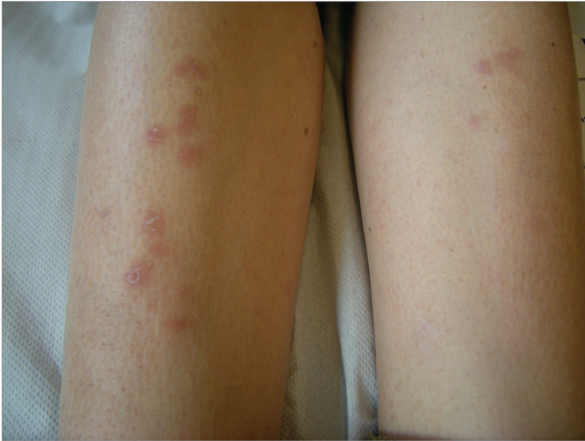
Figure 1. Erythematous and subcutaneous nodular lesions at the lower limbs.