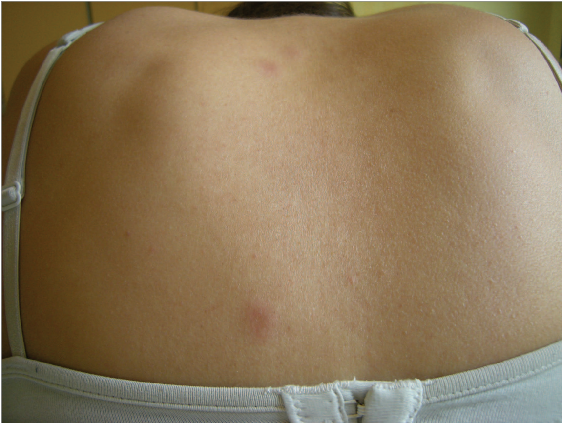
Figure 2. Erythematous and subcutaneous nodular lesions at the intrascapular region.

images. A copy of the written consent is available for review by the Editor-in-Chief of this journal.