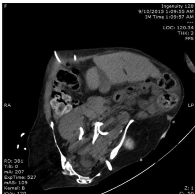
FIG. 4. Postoperative CT imaging following primary PCNL. Left nephrostomy tube can be seen entering through the sciatic foramen. A portion of right nephrostomy tube visible in the right renal pelvis.

using a rigid nephroscope and ultrasonic lithotripter. The entire kidney was then carefully inspected using a flexible nephroscope as well as fluoroscopy and was determined to be free of any stones. The patient was discharged later that day with bilateral nephrostomy tubes to dependent drainage. She will complete a 10-day course of ciprofloxacin at home based on previous antimicrobial sensitivities.