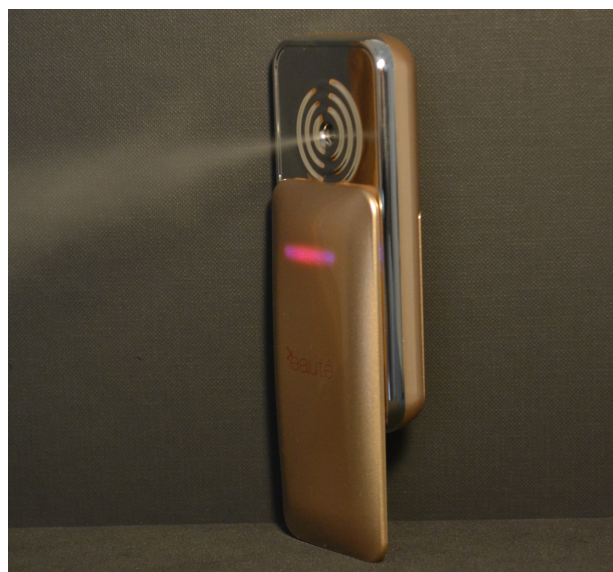
Figure 2 Nebulization of the formulation LVB-TOC-BC by the portable device Eauté.