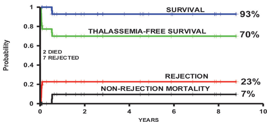
Figure 1. Results in 31 haploidentical transplant in thalassemia.