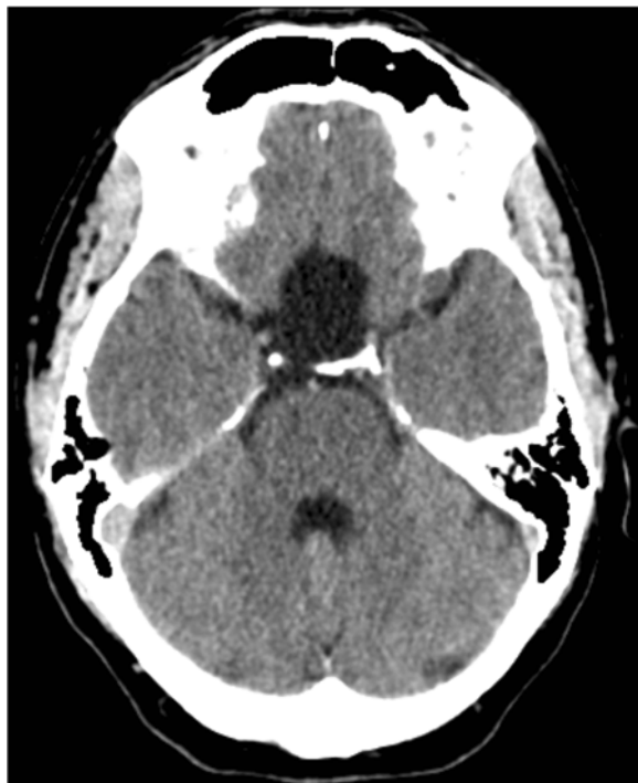
Figure 1 CT of the brain demonstrating a large supra- and intrasellar arachnoid cyst with mass effect on adjacent structures.