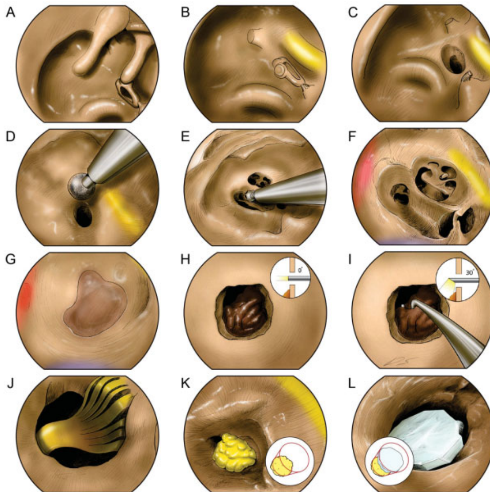
Fig. 2 Surgical procedure. (A) The tympanic membrane and skin of the external auditory canal were elevated and harvested en bloc, exposing the tympanic cavity. (B) The incudostapedial joint was separated, and the incus was removed. The tensor tympani tendon was excised, and the malleus was removed to expose the entire tympanic tract of the facial nerve. The tensor muscle was drilled using a microdiamond burr until the geniculate ganglion was visualized to identify the tympanic segment of the facial nerve. (C) The stapes was removed from the oval window to expose the vestibule. (D) The inferior lip of the oval window was gently removed using microdrills to enlarge the opening and expose the saccular fossa in the medial aspect of the vestibule. (E, F) The promontory was then drilled to expose the basal, middle, and apical turns of the cochlea. (G) Drilling was performed around the inferior aspect of the vestibule until the fundus of the internal auditory canal (IAC) was exposed. (H) The dura of the IAC was exposed completely. The vestibular schwannoma was removed from the meatus to the fundus of the IAC, preserving the facial nerve. The tumor was dissected piecemeal until radical resection was achieved. (I, J) The surgical field was reexamined using a 30-degree endoscope to identify any possible residual disease. The facial nerve was traced and its function was evaluated using a monitoring device. (K) Pieces of the ear lobule fat, tragal perichondrium, and soft tissue were harvested and used to plug the inner ear entrance. (L) The tragal cartilage was harvested, and a cartilage tympanoplasty was performed.