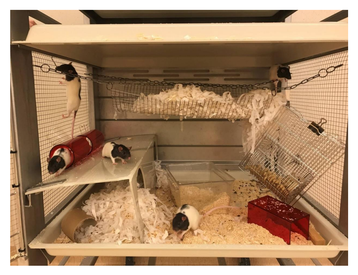
Figure 2. Refined rat housing which allows the animals to rear and climb. All the rats at RISE (Research Institutes of Sweden) are housed in modified rabbit cages.

with appropriate infrastructure to deal with moving and cleaning the caging, as in the Research Institutes of Sweden shown in Figure 2. We can only speculate as to the counterinfluences that would be exerted by economic factors and perceptions regarding what would be a fair compromise between human and animal needs, and how all of these factors would be balanced. However, individual establishments can consider investing in better rat caging at any time, regardless of legal minimum standards, in accordance with their own Culture of Care.