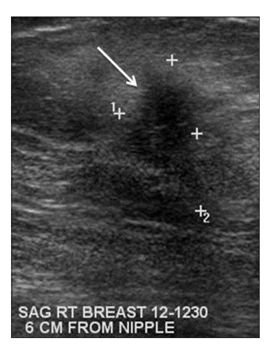
Figure 3: Gray-scale sonograhic image of the right breast demonstrates an irregular hypoechoic mass with angular margins (arrow). Similar masses were present in the bilateral breasts at nearly every clock position by ultrasound. This mass was biopsy proven to be sarcoidosis.