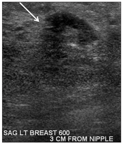
Figure 4: Gray-scale sonographic image of the left breast at the 6:00 o'clock position at the site of known lobular carcinoma also demonstrates an irregular hypoechoic mass (arrow).