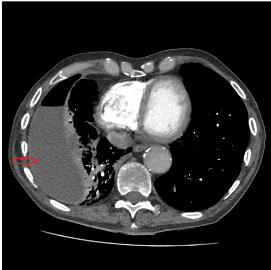
FIGURE 2: CTPA show right-sided encysted hydropneumothorax, consolidation within the right middle and lower lung zones (red arrow) and small bilateral pulmonary emboli

CTPA: computerized tomography pulmonary angiogram