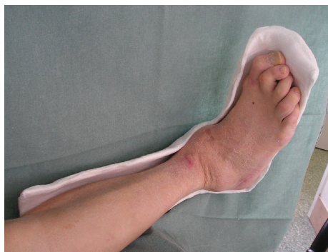
FIGURE 2: Dorsal L—removable contact splint—final product.

operations of the forefoot; 29.1% (37/127) of patients had undergone Lisfranc amputations, tarsal bone procedures, such as bone abrasions, extirpations, and resections, and soft tissue operations of the midfoot; and 9.5% of patients had undergone calcaneal resections (including abrasions) and soft tissue procedures of the hindfoot. Patients that had undergone the following procedures were excluded from the study: bone biopsies and dissections, fistula resections, ulcerectomy, simple tenolysis, Syme amputations, and major amputations.