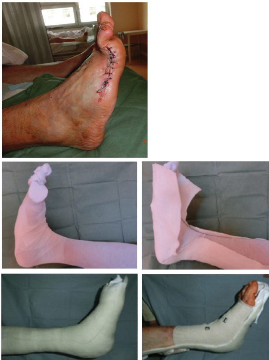
FIGURE 1: Removable contact splint manufacturing.

were analysed over the course of the follow-up period. Results were also compared with regard to the locations of the surgical procedures performed.