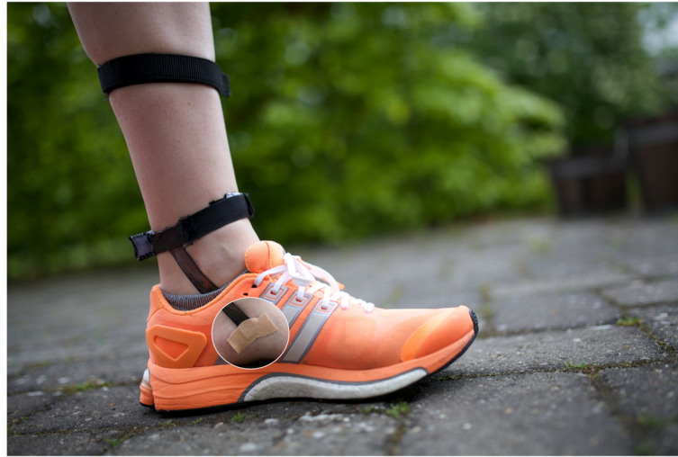
Figure 1 Placement of the stretch sensor.

malleoli to minimise the movement of the device caused by contractions of the muscles in the lower leg.