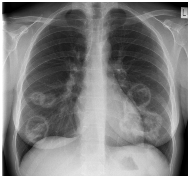
Figure 1 Chest radiograph showing multiple cavitating lung lesions in a patient with Wegener's granulomatosis.

WG is characterized by granulomatous inflammation of the upper and lower respiratory tract and a high rate of relapse.