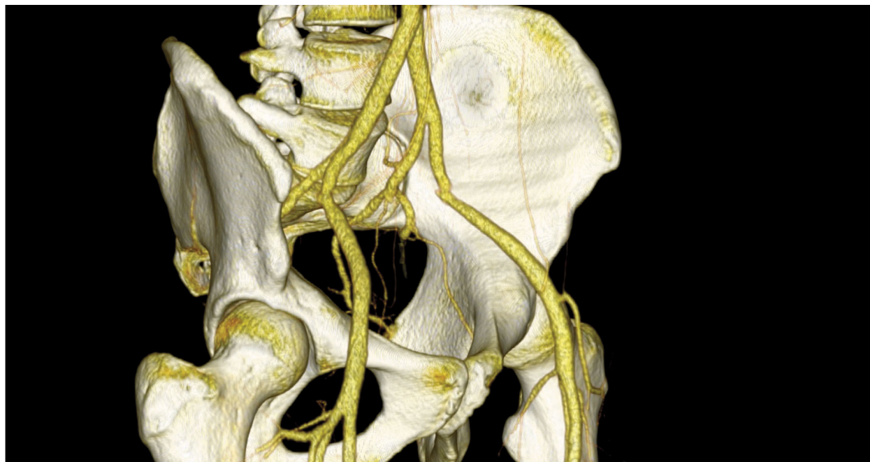
FIGURE 2: A 3-dimensional reconstruction of the patient's computed tomographic angiogram of the abdominal aorta and common iliac arteries, revealing the stenosis and kink in the proximal half of the left external iliac artery (LEA). We can observe two atypical branches of the LEA; one climbing towards the ilium and the other passing anterior to the left femoral head. Poststenotic dilation is noted. (The patient agreed to the publishing of his radiological images.)