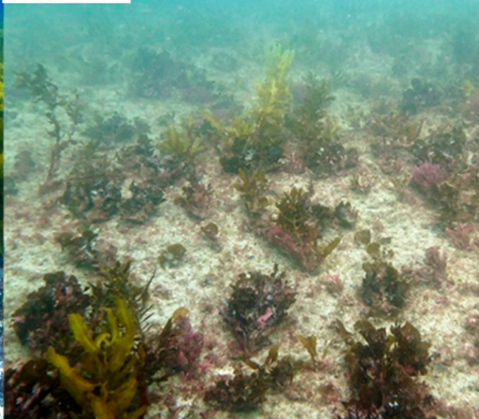
A marine heatwave off the west coast of Australia decimated kelp populations.

could harvest earlier, before a heatwave killed their stock. Amaya's latest research shows "significant prediction skill 6 to 8 months in advance," he says (8).