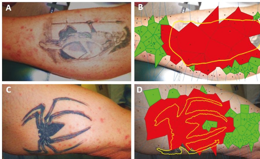
FIGURE 3: Tattoo #2 (panels (a) and (b)) and tattoo #3 (panels (c) and (d)). (a)–(c) Clinical pictures. (b)–(d) Voronoi patches intersecting (red) or not intersecting (green) tattooed skin areas (yellow contoured).

On the other hand, macrophages emerge also as a key cell species in the pathophysiology of psoriasis. In human psoriasis, a subpopulation of classically activated proinflammatory macrophages plays a crucial role in the pathogenesis of skin lesions, and a preponderance of M1 macrophage activation state is also associated with increased PASI scores [21]. In accordance with above, markers of M2