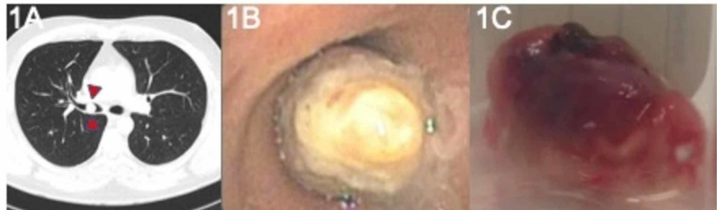
FIGURE 1: (A) Obstructing mass visualized on CT of the chest (red arrowheads); (B) Obstructing mass visualized in the distal right mainstem bronchus during inspection bronchoscopy; (C) Gross view of mass following resection

polypoid endobronchial tumor in the distal right mainstem bronchus extending into the bronchus intermedius (BI) without associated parenchymal abnormalities (Figure 1A). Bronchoscopy revealed a near-complete obstructing mass in the distal right mainstem bronchus anchored on a wide stalk (Figure 1B), with otherwise normal-appearing bronchial mucosa throughout the remainder of the tracheobronchial tree. After obtaining fine needle aspiration sampling, an electrocautery snare (ConMed, Utica, NY) was performed to resect the mass (Figure 1C).