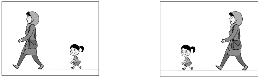
Figure 1. A sample of a picture pair used in the binary sentence-picture matching tasks