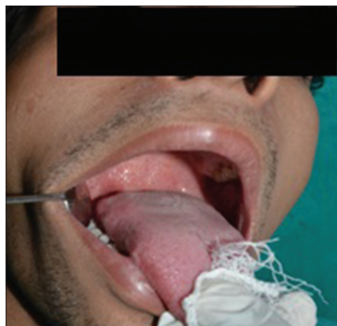
Figure 5: Follow-up at 5 months showed no reoccurrence of symptoms