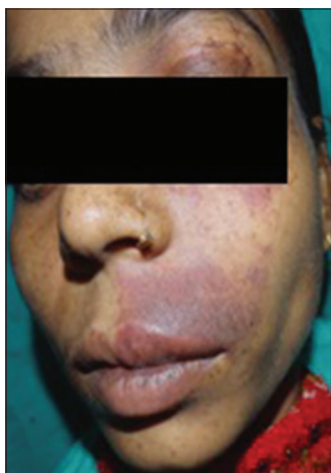
Figure 2: Follow-up at 5 months showed no reoccurrence of symptoms

VMs comprise the second major category of congenital vascular lesions. This group of lesions reflects abnormalities in blood and lymphatic vessel morphogenesis. Histologically, these vascular lesions are characterized by normal endothelial