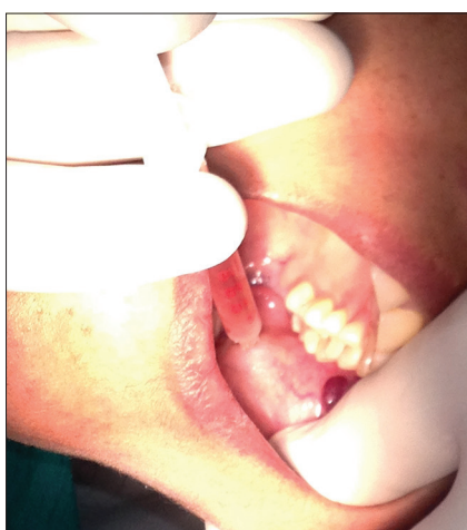
Figure 8: Injection of sodium tetradecyl sulfate brand name (Setrol)