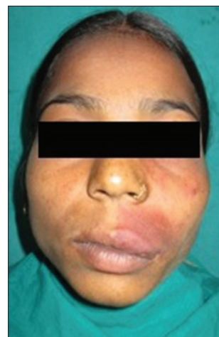
Figure 1: Profile view of the patient showing swelling in the left side upper lip

We present a 30-year-old female referred to our Oral and Maxillofacial Surgery Clinic by a general dentist on account of swelling of the upper lip and discoloration of birth duration [Figure 1] which posed a diagnostic and management challenge. The patient claimed, and she had been treated by a spiritualist before presenting to the general dentist that referred her to our center. No previous history of trauma or use of medications known to