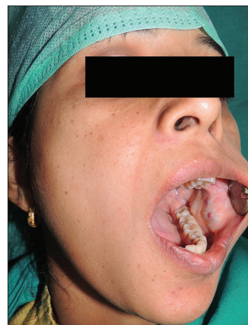
Figure 7: Intraorally swelling in the left buccal mucosa of size 2 cm x 1 cm approximately