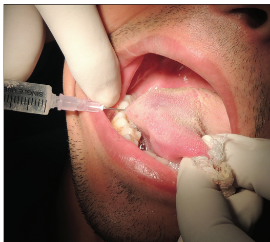
Figure 4: Injection of sodium tetradecyl sulfate brand name (Setrol)