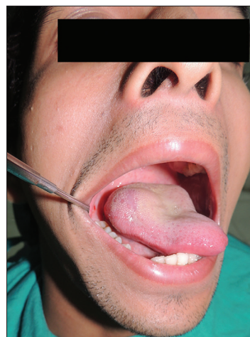
Figure 3: Profile view of the patient showing swelling in the right lateral border of the tongue of size 1.5 cm × 1 cm approximately