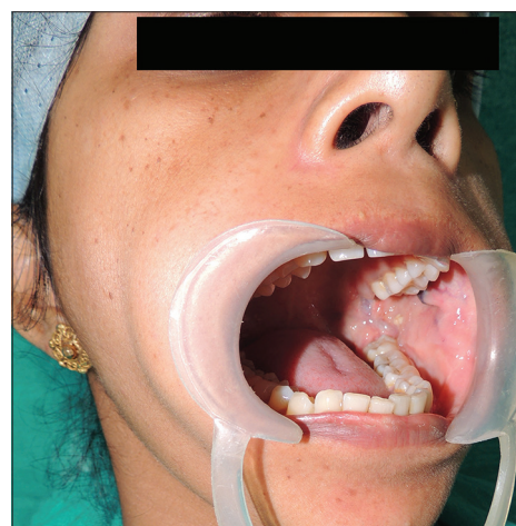
Figure 9: Follow-up at 5 months showed no recurrence of the symptoms

cells and normal numbers of mast cells throughout their natural history. Unlike hemangiomas, VMs are present at birth although they may not be clinically evident until late infancy or childhood. The growth of these lesions is commensurate with that of the patient, and they do not regress or involute. Rapid enlargement of these malformations may occur as a result of trauma, infection, or endocrine changes (e.g., pregnancy and puberty). Skeletal abnormalities are more commonly seen in association with VMs (35%) than with hemangioma. The classification scheme of these lesions is based on the predominant type of anomalous vessel involved and includes low-flow lesions (capillary, venous, and lymphatic malformations) and high-flow lesions (arteriovenous malformations). Complex VMs sharing features of multiple types of lesions also occur, termed combined VMs. [17]