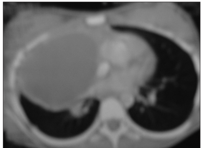
Figure 2: Computed tomography scan of thorax showed a large well-defined cystic mass adherent to superior vena cava