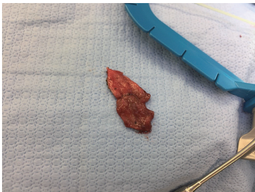
Figure 2 Rectal mucosal graft.

Five patients were identified for inclusion in the study with median follow-up time of 13.5 months (range, 12.5–25.5 months) ( Table 1 ). Four patients had prior BMG urethroplasties and one had a history of undergoing radiation for head and neck cancer. Average (SD) age at time of surgery was 52.4 (13.1). Average (SD) stricture length was 4.4 (0.5) cm. Stricture location was bulbar urethra for four and pendulous urethra for the fifth patient. Patent urethras were demonstrated in all five patients