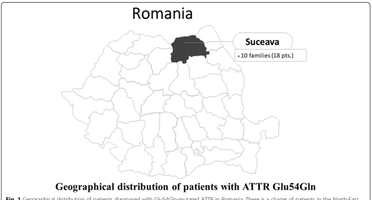
Fig. 1 Geographical distribution of patients diagnosed with Glu54Gln-mutated ATTR in Romania. There is a cluster of patients in the North-East area of Romania, in Suceava County. Most patients come from a single town in this county, Todiresti. "Free Romania Editable Map" by vourfreetemplates.com is licensed under CC BY-ND 4.0

Of the 18 patients in this study, eight (44%) were male and 10 (56%) were female. Of these, five were asymptomatic carriers (age range: 16–32 years), 10 were symptomatic patients (age range: 35–53 years), and three patients had died during the study (Table 1). Asymptomatic carriers