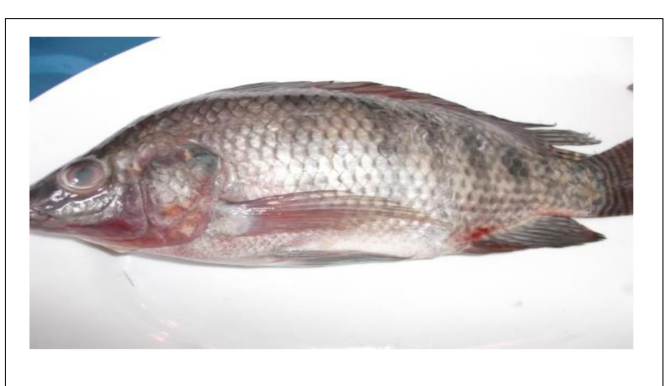
FIGURE 1 | Tilapia fish showing externally eye opacity, dark skin discoloration in the form of strips, congested base at the pelvic fin, hemorrhagic pelvic fin, and distended abdomen.

The clinical picture and postmortem lesions of the experimentally infected tilapia were seen as: external lesions ( Figure 1 ): eye lesions: in the form of unilateral or bilateral eye redness/opacity; Skin lesions: detached scales, extensive skin congestion, ulcers, hemorrhage, or dark discoloration in the form of strips; Fins: congestion at the base of the fins, or even hemorrhagic; Abdomen: slightly distended in some cases; Anal opening: congested with protruded anal opening.