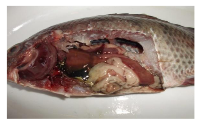
FIGURE 2 | Tilapia fish postmortem internal findings revealed typical signs of septicemia in which severely congested gill, kidney, spleen, intestine and heart, dark gall bladder, in addition to hemorrhagic ascites, friable mottled liver, muscle redness, and parts of the intestine were devoid of food.

Postmortem lesions ( Figure 2 ): general signs of septicemia; Muscle: redness; Kidney: renal congestion; Liver: friable, pale and congested, dark gall bladder; Spleen: enlarged and congested; Heart: congested; Intestine: intestinal congestion and devoid of food; Gill: congested; Abdominal cavity: hemorrhagic ascites.