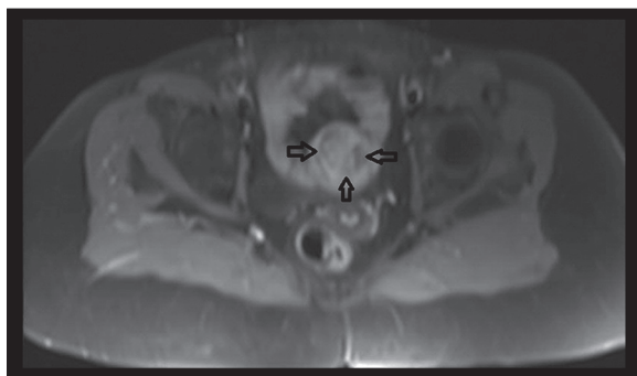
Figure 3. Axial contrast-enhanced T1-W fat-suppressed MR image shows heterogeneous enhancement with hypointense areas (arrows).

The imaging characteristics of lipoleiomyoma afford the radiologist an opportunity to make a specific diagnosis. On sonography, it is a well-defined heterogeneous mass containing hyperechoic areas due to the presence of fat. Similarly, on CT images it shows areas of fat attenuation. Such as in our case, MR imaging reveals a heterogeneous mass with hyperintensity on T1-weighted images, and low