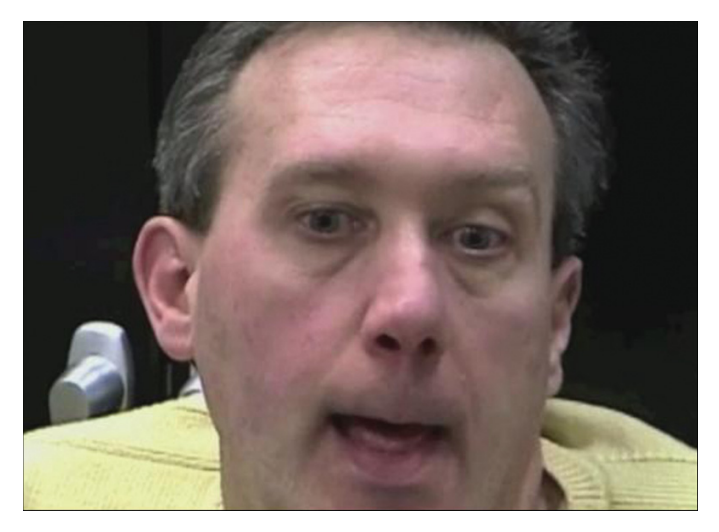
Video 2. The Patient at Initial Visit. The patient demonstrates facial masking and a mild quizzical stare. He demonstrates a saccadic gaze palsy, with inability to look left or vertically on command. Rightward eye movements are possible, but attempts at saccades demonstrate severe slowing.

palsy is due to brainstem injury.<sup>4</sup> Saccadic gaze palsy is characterized by slow, hypometric saccades and absent quick phases of optokinetic nystagmus, with intact vestibular ocular reflexes. Vertical saccades may be affected in isolation, though both vertical and horizontal saccades are typically impaired. As in most cases (summarized in Table 1), our patients' MRIs did not reveal a brainstem injury, likely because of insufficient imaging resolution.<sup>5</sup> Importantly, one of our cases did have an occipital infarction as evidence of posterior circulation ischemia. The mechanism of injury in this syndrome remains unclear, although a perioperative ischemic stroke from embolism, hypothermia protocol, hypotension, hyperviscosity, or