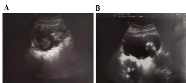
Figure 1: Imaging of the ovarian teratoma on the ultrasound; A) Ovarian teratoma on the vaginal ultrasound imaging; B) Ovarian teratoma on the abdominal ultrasound imaging

MRI brain showed a condition of mild posterior hemisphere edema. Her abdominal CT (Computed Tomography) and ultrasound (Figure 1) revealed a 90 x 60 mm ovarian teratoma in the right ovary.