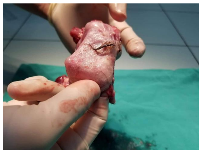
Figure 2: Imaging of the ovarian teratoma after surgery

After a consultation within the most important departments of the hospital (including neurologists, internists, psychiatrists, intensivists, infectious disease specialists, radiologists, gynecologists and pathologists), we decided to used immunoglobulin therapy and the gynecologist removed the ovarian teratoma by using laparoscopic method at the Obstetrics Department in Bach Mai Hospital. She was treated with intravenous immunoglobulin to against anti-NMDA receptor encephalitis and went through minimal changes in neurologic symptoms. We used Intratect (Immunoglobulin G2,5g) for her with the dose of 20 gr per day on 5 consecutive days. Besides, she also received corticosteroid therapy by IV 5 days after surgery with Methylprednisolone 1 g per day. She experienced a successful surgery (Figure 2). Within 24 hours after surgery, she achieved a remarkable improvement in her cognitive function (the patient could recognize herself, her parents' names, and in few days later she could remember previous events). The result of histopathology showed the present of mature teratoma and nerve tissue. Several days later, she had recovery with good condition and could be discharged.