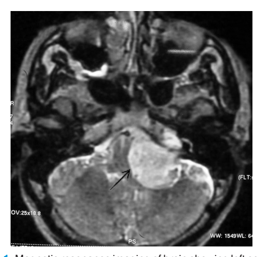
Figure 1: Magnetic resonance imaging of brain showing left cerebellopontine angle mass lesion (arrow) compressing the brainstem

Cardiac pathology, hypoxia, light plane of anesthesia, use of agents like \beta -blockers, \alpha_2 -agonists, potent narcotics, and other anesthetic drugs may all lead to bradycardia or asystole during an ongoing surgery. The asystole may also be produced through paradoxal cardiovascular reflexes. [3] Neurogenic bradycardia that may result in cardiac arrest is a rare, but well recognized complication during anesthesia. An acute increase in intracranial pressure and a subsequent secondary brainstem compression may be the reason. Sometimes, it